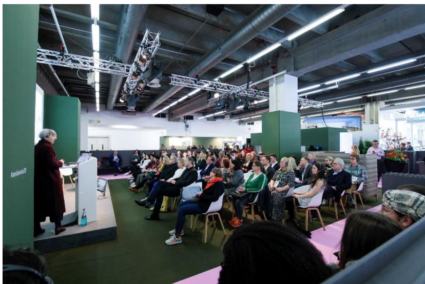
Lectures from well-known industry experts explore how the consumer goods industry will develop.